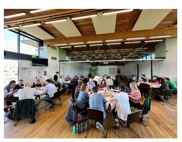
Three Hills Sport Park, Folkestone – 7<sup>th</sup> May 2024