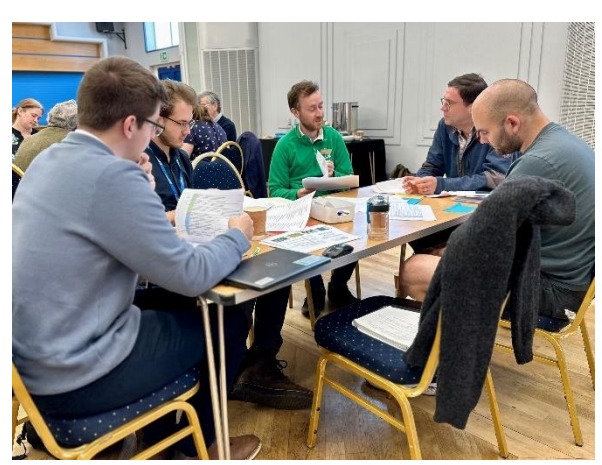
Stag Theatre, Sevenoaks – 9<sup>th</sup> May 2024